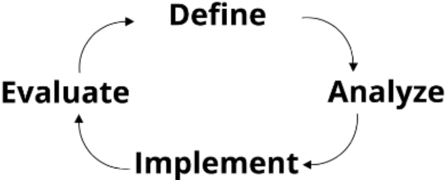
Illustration of the cyclical nature of data-based decision-making