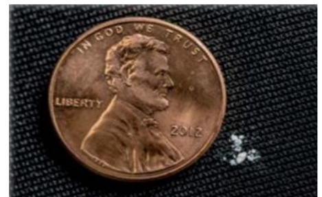
Potentially Fatal Dose of Fentanyl

hand sanitizer can enhance transdermal absorption of the drug and should not be used. www.dea.gov/druginfo/Fentanyl_BriefingGuideforFirstResponders_June2017.pdf .