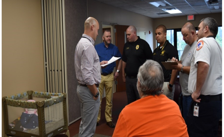
Putnam County—Death Investigation 101

The next two training sessions will be held on August 9, in judicial district 14 (Coffee County) and August 15, in judicial district 17 (Marshall Counties). Coffee County registration is available online at: https://goo.gl/forms/MZaEm5W0nZ5U9lfy2 . Marshall County registration is available online at: https://goo.gl/forms/iad8xJuWIXMNjk653 . All CMEs and CME-Is in these and any surrounding counties are welcome to register and attend.