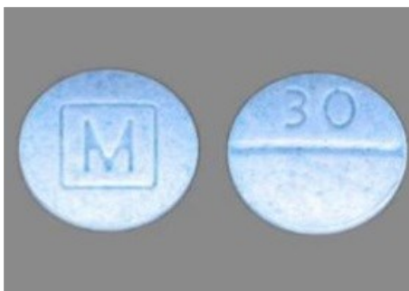
Pharmaceutical Oxycodone (above)

In many cases, the drug is made to look like oxycodone or alprazolam tablets and sold as such. In west Tennessee, there has been a recent large seizure of counterfeit oxycodone pills, marked "M 30" and "ALG 265". These pills contain U-47700, furano-fentanyl, and a third substance suspected to be a synthetic