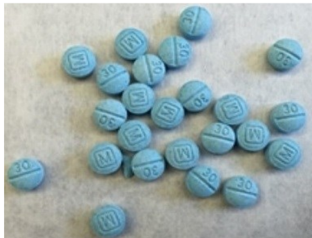
Counterfeit Oxycodone (above)

Synthetic opioids have arrived in Tennessee. We are all aware of the increase in fentanyl-related deaths over the past 4 or 5 years, both nationwide and in Tennessee. Carfentanil, a new, even more lethal, drug has emerged. Fentanyl is about 50 times as potent as morphine; carfentanil is about 100 times as potent as fentanyl. In April, Metropolitan Nashville police (MNP) intercepted an envelope from the mail containing 140 mg of carfentanil. For comparison, an adult male elephant requires 10-15 mg of carfentanil to become fully sedated. Just a few grains of this powder-like substance are enough to cause death in an adult, and the drug can be absorbed orally, transdermally, injected, via inhalation, or through contact with mucous membranes or the eyes.