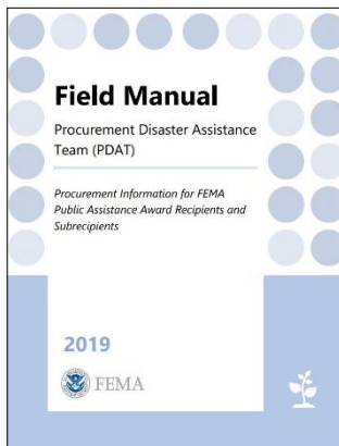
PDAT Field Manual

This in-depth resource lists, describes, and exemplifies the mandatory requirements for recipients and subrecipients when purchasing under a FEMA award. This manual supersedes the 2014 and 2016 versions of the Field Manual.