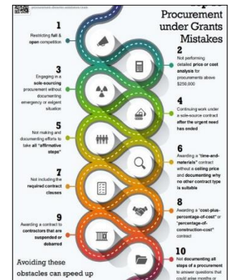
Top 10 Mistakes when Purchasing Under a FEMA Award

This contract provisions guide helps recipients and subrecipients understand which clauses are required for their contract and includes sample language for those clauses. This guide supersedes the 2019 version of the contract provisions template, which is also available in Spanish .